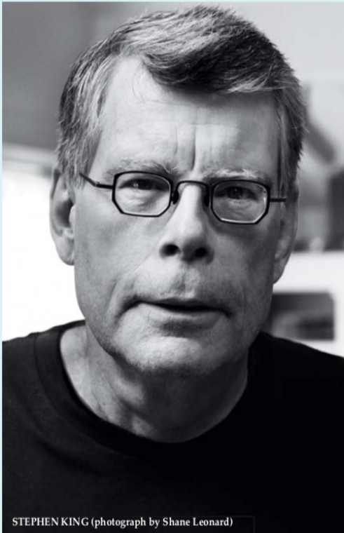
STEPHEN KING